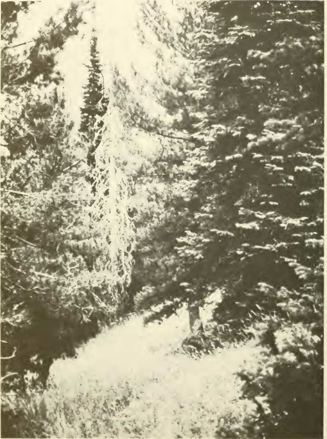
Fig. 3. Coniferous Forest Biome. Elko County: Snowslide Gulch, Jarbidge Mountains.